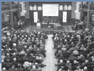
Participants at the EUA Convention in Glasgow

In the second half of 2005, EUA started to follow up on a number of different projects intended to support universities in this key period of implementation ( cf. section 2 ), including the preparation of a Bologna Handbook, together with Raabe publishers, that will be available in mid 2006. This practical guide will provide information, analysis and concrete advice on implementing the various Bologna actions and tools in universities.