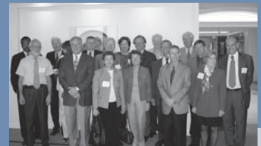
Participants of the Transatlantic Dialogue in Washington, D.C.