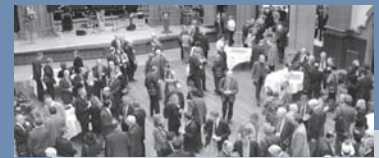
Participants in Uppsala