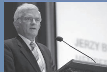
Member of European Parliament, Jerzy Buzek, at the EUA Conference in Uppsala

The key event in 2005 was the Salzburg Conference (February 2005), an official "Bologna Seminar" which identified "ten basic principles" for the future development of doctoral programmes ( cf. section 2.E ). The results of this conference fed into the drafting of and are, indeed, reflected in the Bergen Communiqué that formally requests EUA to prepare a report on doctoral programmes for the London Ministerial meeting in 2007. EUA has now launched a series of activities in this area for 2006, designed to ensure broad discussion and further development of the work done hitherto, working together with the Austrian and French governments, EURODOC and ESIB.