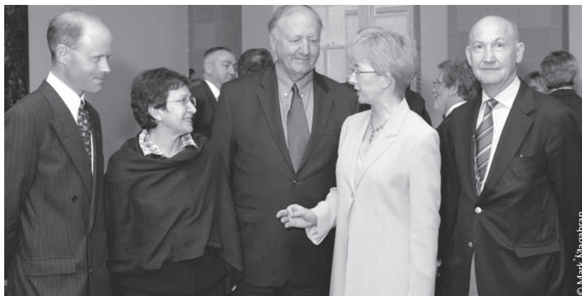
Mary Hanafin TD, Irish Minister for Education and Science, discussing with the EUA team at the launch of EUA's "Quality Review of Irish Universities"

A significant effort has been made in 2005 to expand the pool and strengthen its introduction to the Programme in order to ensure appropriate levels of knowledge of new European developments. This effort will continue in the years ahead.