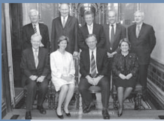
EUA Board 2005-2009