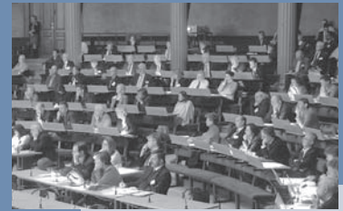
Plenary session in Uppsala

Over the last year, EUA has strengthened relations with the US Council of Graduate Schools focusing on the important issues of reforms in doctoral training and the impact of the new (Bologna) degree structures on admission of European students to US graduate schools. Other partners include the Council on Higher Education Accreditation (CHEA) on the key issue of accountability and self-governance, and the Association of International Educators (NAFSA).