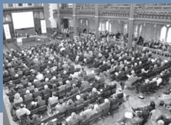
Plenary session in Glasgow

In addition, EUA participates in various working groups set up by the European Commission in the field of research as mentioned above and in the field of higher education (e.g., stakeholders' groups for preparing the EC's future lifelong learning programme). EUA was also active in the European Commission's conference on the contribution of European higher education to the knowledge society and was invited to contribute to a hearing organised by the Committee of the Regions in July. Finally, in December 2005 the EUA President was designated by the Commission to participate in the experts' group on Universities set up after the informal Heads of State Summit in Hampton Court in October 2005.